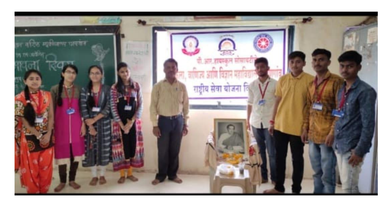
Paticipating in Sadbhavna Din