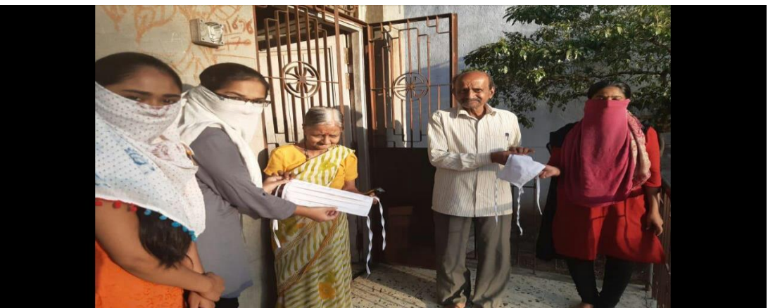
Awareness and distribution of mask in lockdown period