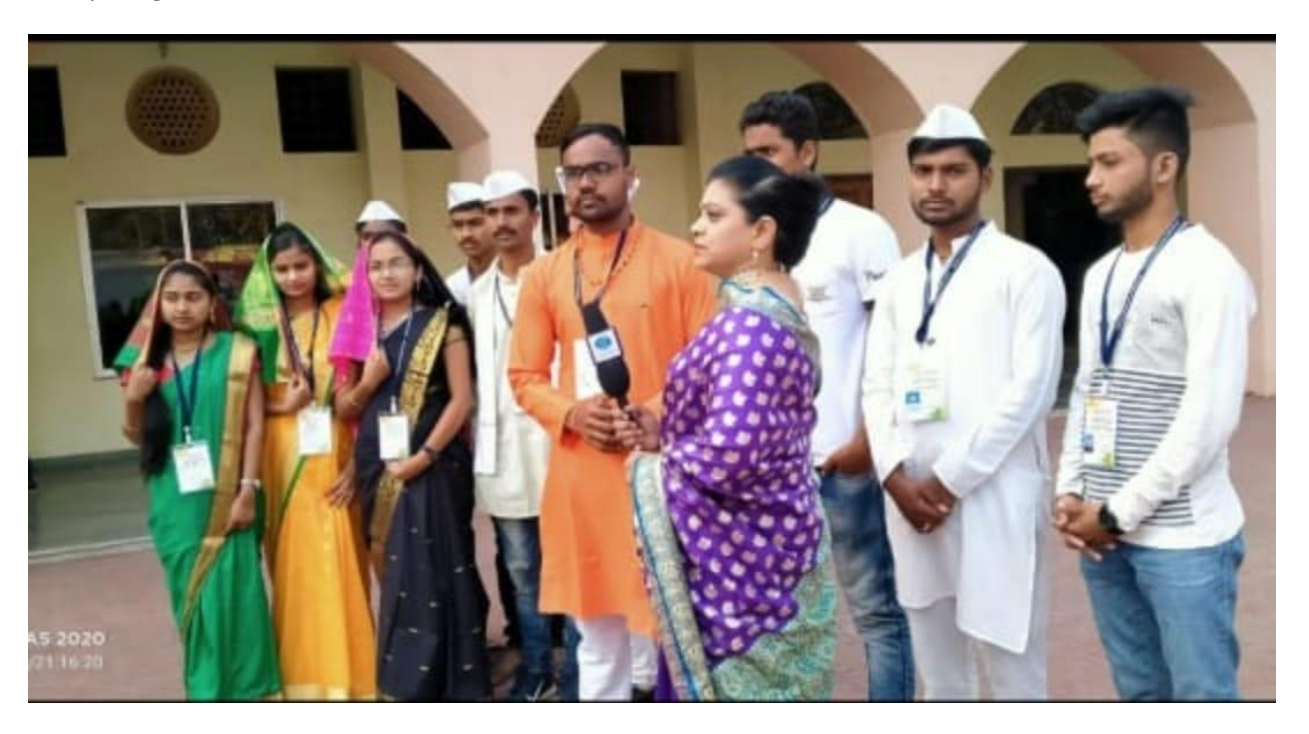
Interview about national integration camp with TV Reporter